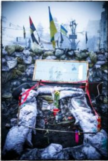
FUNDRAISER FOR THE FAMILIES OF VICTIMS OF THE MASS MURDER IN UKRAINE