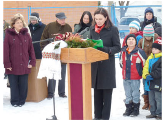
Deputy Minister of Tourism, Parks, Culture and Sport, Wynne Young