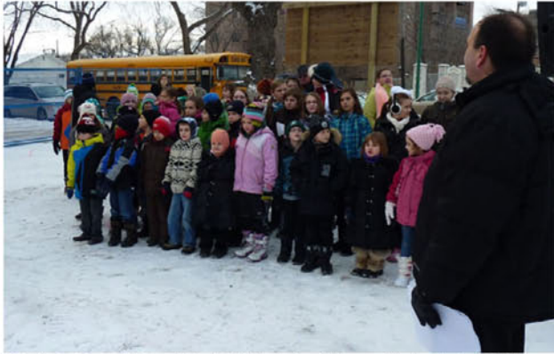
Students from Bishop Filevich Ukrainian Bilingual School sing Otche Nash (Our Father) in Ukrainian, and O Canada in 3 languages.